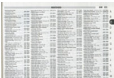
Luis Camnitzer, Memorial, 2009.

telephone directory but whose existence has not been annulled. It introduces a visual record of an unresolved question—as happens in Argentina, where many of the disappeared figure in the electoral registry and are counted as absentees instead of as disappeared, as human rights organizations demand ("Padron..." 2009). Memorial constructs an archive that remits, in one sense, to other archives that are assumed to exist but that remain hidden. 8 Introducing names that have been eliminated once again is a way of forcing the mechanisms that administer life on the basis of agreement with one sector of public forces. As Camnitzer says, "The names I added will not answer our calls. They are, instead, names that will continue to call upon us to answer" (2010, 27).