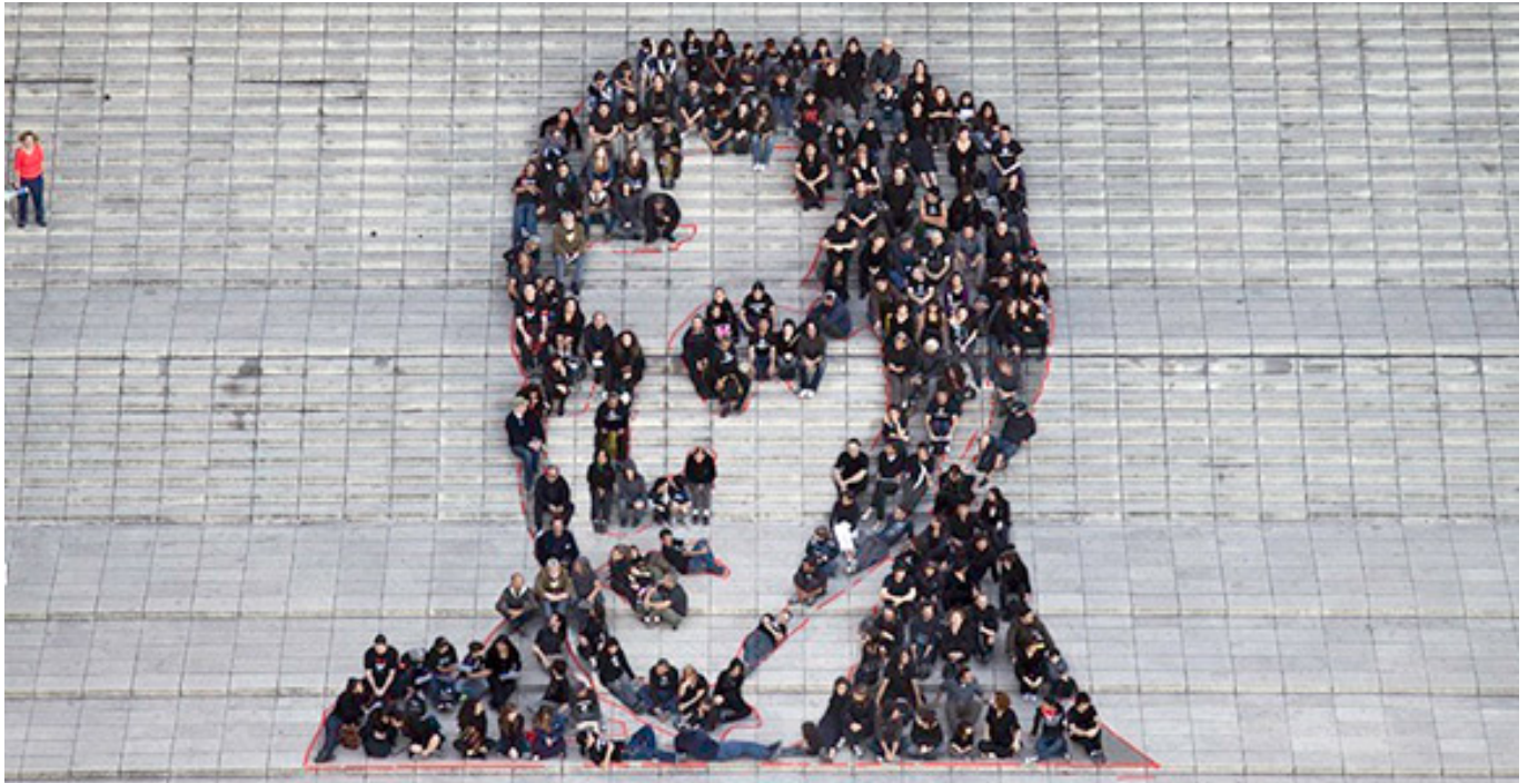
Res, Belgrano en el monumento (Belgrano at the Monument) , 2009.