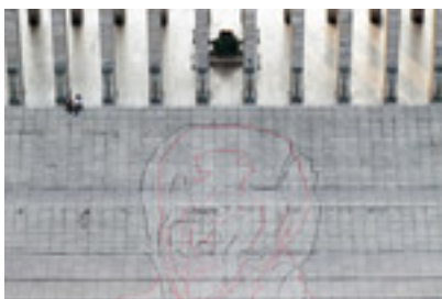
Res, Belgrano y Santucho dibujados en el Monumento.